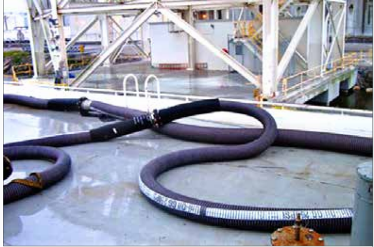
Hose in service: Note the gradual bend achieved off of the horizontal connections