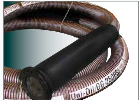
Hose is coiled and when placed on a pallet, is ready for shipment.